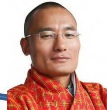
Tshering Tobgay, Bhutan