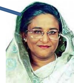
Sheikh Hasina, Bangladesh