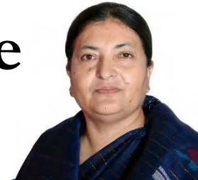
Bidya Bhandari, Nepal