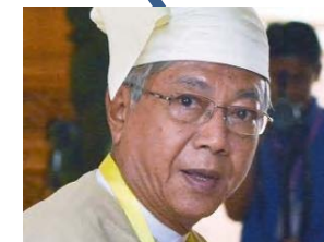
Htin Kyaw, Myanmar (Burma)