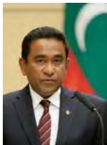
Abdullah Yameen, Maldives