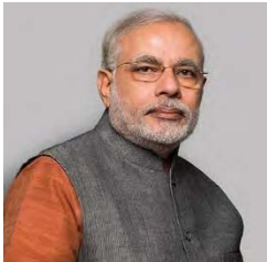
Narendra Modi, India