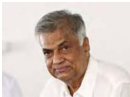
Ranil Wickremesinghe, Sri Lanka