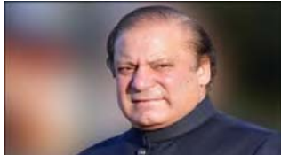
Nawaz Sharif, Pakistan